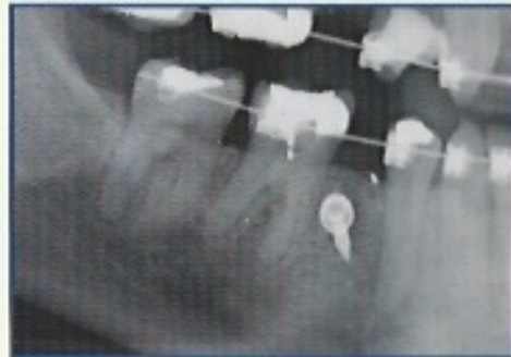
An X-ray showing a mini-screw placed between the lower teeth